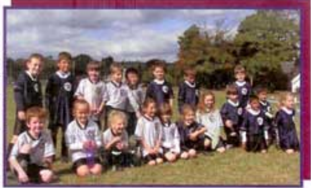
FIRST GRADE SOCCER TEAMS

Game days kick off at 9:00 AM with our Lee's Clinic program for kindergarten players where they get an introduction to soccer skills and also get a chance to play scrimmage games against their friends. Lee's Clinic is followed by back to back games played by our 14 Division teams with players from the first to fifth grade.