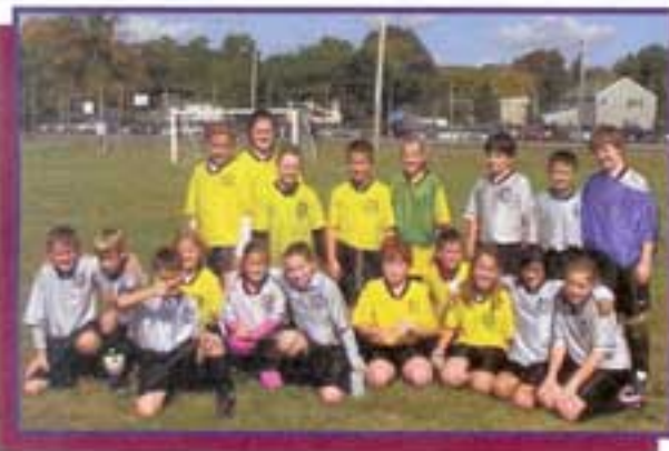
4TH & 5TH GRADE SOCCER TEAMS

after a well played match. The Morris Plains Soccer Board would like to thank all the coaches, volunteers, parents, and community members who help make this happen.